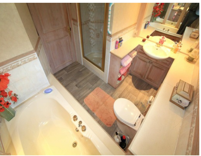
Bathroom Kitchen Conservatory Bedroom Lounge