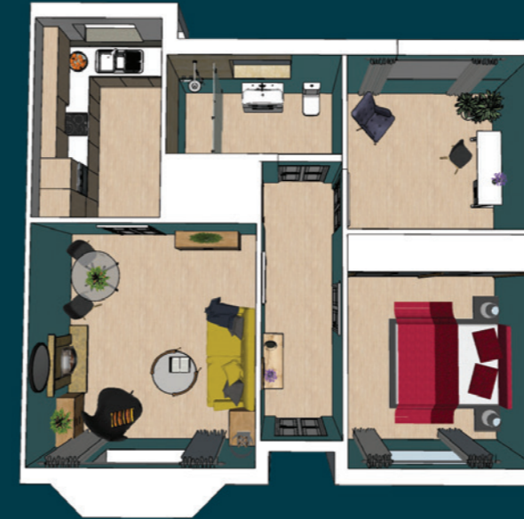
A typical property at Carrs Court

A company acts through two bodies of people – its shareholders and its Board of Directors. A Board of Directors is elected by the Shareholders of the Owners' Company. The number of Directors shall not be less than 3 but no more than 5. The Court's Board of Directors are in charge of the management of the company's business; supported by the Retirement Security team, they make the strategic and operational decisions of the company and are responsible for ensuring that the company meets its statutory obligations.