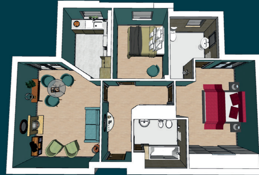
A typical property at Margaret Court

A company acts through two bodies of people – its shareholders and its Board of Directors. A Board of Directors is elected by the Shareholders of the Owners' Company. The number of Directors shall not be less than 3 but no more than 5. The Court's Board of Directors are in charge of the management of the company's business; supported by the Retirement Security team, they make the strategic and operational decisions of the company and are responsible for ensuring that the company meets its statutory obligations.