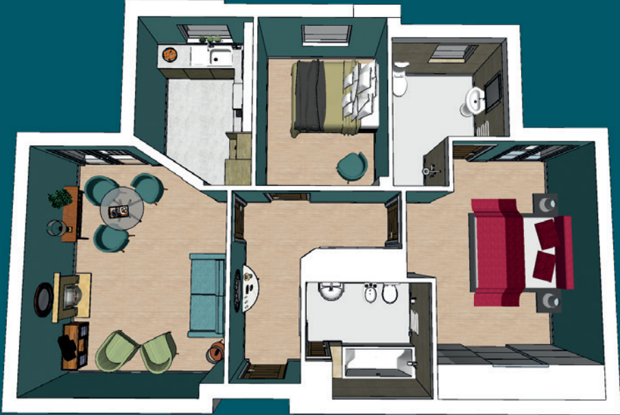
A typical property at Margaret Court

A company acts through two bodies of people – its shareholders and its Board of Directors. A Board of Directors is elected by the Shareholders of the Owners’ Company. The number of Directors shall not be less than 3 but no more than 5. The Court’s Board of Directors are in charge of the management of the company’s business; supported by the Retirement Security team, they make the strategic and operational decisions of the company and are responsible for ensuring that the company meets its statutory obligations.