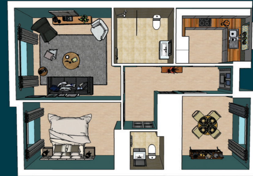
A typical property at Forum Court

A company acts through two bodies of people – its shareholders and its Board of Directors. A Board of Directors is elected by the Shareholders of the Owners' Company. The number of Directors shall not be less than 3 but no more than 5. The Court's Board of Directors are in charge of the management of the company's business; supported by the Retirement Security team, they make the strategic and operational decisions of the company and are responsible for ensuring that the company meets its statutory obligations.