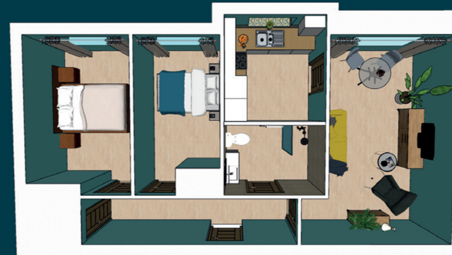
A typical property at St. George's Court

A company acts through two bodies of people – its shareholders and its Board of Directors. A Board of Directors is elected by the Shareholders of the Owners' Company. The number of Directors shall not be less than 3 but no more than 5. The Court's Board of Directors are in charge of the management of the company's business; supported by the Retirement Security team, they make the strategic and operational decisions of the company and are responsible for ensuring that the company meets its statutory obligations.