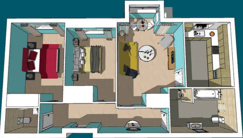
A typical property at Tannery Court

A company acts through two bodies of people – its shareholders and its Board of Directors. A Board of Directors is elected by the Shareholders of the Owners’ Company. The number of Directors shall not be less than 3 but no more than 5. The Court’s Board of Directors are in charge of the management of the company’s business; supported by the Retirement Security team, they make the strategic and operational decisions of the company and are responsible for ensuring that the company meets its statutory obligations.