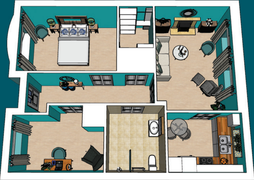
A typical property at Pinner Court

A company acts through two bodies of people – its shareholders and its Board of Directors. A Board of Directors is elected by the Shareholders of the Owners’ Company. The number of Directors shall not be less than 3 but no more than 5. The Court’s Board of Directors are in charge of the management of the company’s business; supported by the Retirement Security team, they make the strategic and operational decisions of the company and are responsible for ensuring that the company meets its statutory obligations.