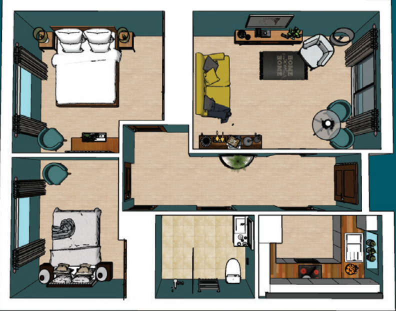
A typical property at Emmbrook Court

A company acts through two bodies of people – its shareholders and its Board of Directors. A Board of Directors is elected by the Shareholders of the Owners’ Company. The number of Directors shall not be less than 3 but no more than 5. The Court’s Board of Directors are in charge of the management of the company’s business; supported by the Retirement Security team, they make the strategic and operational decisions of the company and are responsible for ensuring that the company meets its statutory obligations.