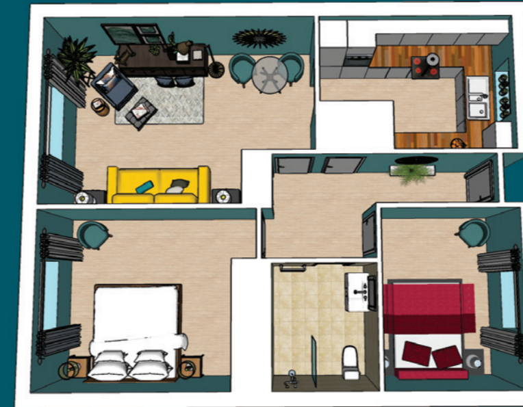
A typical property at Oaktree Court

A company acts through two bodies of people – its shareholders and its Board of Directors. A Board of Directors is elected by the Shareholders of the Owners' Company. The number of Directors shall not be less than 3 but no more than 5. The Court's Board of Directors are in charge of the management of the company's business; supported by the Retirement Security team, they make the strategic and operational decisions of the company and are responsible for ensuring that the company meets its statutory obligations.