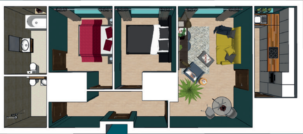
A typical property at Boat Lane Court

A company acts through two bodies of people – its shareholders and its Board of Directors. A Board of Directors is elected by the Shareholders of the Owners’ Company. The number of Directors shall not be less than 3 but no more than 5. The Court’s Board of Directors are in charge of the management of the company’s business; supported by the Retirement Security team, they make the strategic and operational decisions of the company and are responsible for ensuring that the company meets its statutory obligations.