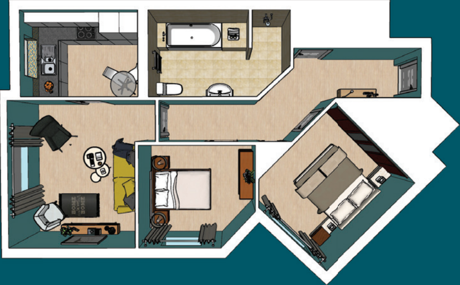
A typical property at Melton Court

A company acts through two bodies of people – its shareholders and its Board of Directors. A Board of Directors is elected by the Shareholders of the Owners’ Company. The number of Directors shall not be less than 3 but no more than 5. The Court’s Board of Directors are in charge of the management of the company’s business; supported by the Retirement Security team, they make the strategic and operational decisions of the company and are responsible for ensuring that the company meets its statutory obligations.