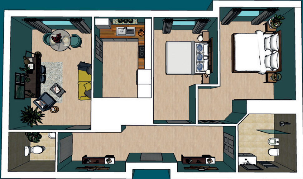
A typical property at Elizabeth Court

A company acts through two bodies of people – its shareholders and its Board of Directors. A Board of Directors is elected by the Shareholders of the Owners’ Company. The number of Directors shall not be less than 3 but no more than 5. The Court’s Board of Directors are in charge of the management of the company’s business; supported by the Retirement Security team, they make the strategic and operational decisions of the company and are responsible for ensuring that the company meets its statutory obligations.