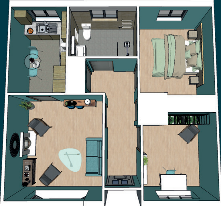
A typical property at Burcot Court

A company acts through two bodies of people – its shareholders and its Board of Directors. A Board of Directors is elected by the Shareholders of the Owners’ Company. The number of Directors shall not be less than 3 but no more than 5. The Court’s Board of Directors are in charge of the management of the company’s business; supported by the Retirement Security team, they make the strategic and operational decisions of the company and are responsible for ensuring that the company meets its statutory obligations.