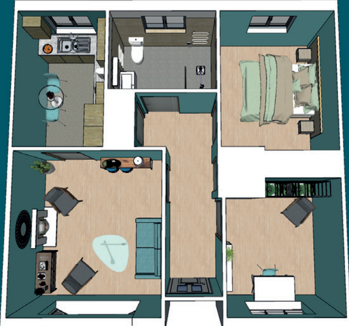
A typical property at Burcot Court

A company acts through two bodies of people – its shareholders and its Board of Directors. A Board of Directors is elected by the Shareholders of the Owners’ Company. The number of Directors shall not be less than 3 but no more than 5. The Court’s Board of Directors are in charge of the management of the company’s business; supported by the Retirement Security team, they make the strategic and operational decisions of the company and are responsible for ensuring that the company meets its statutory obligations.