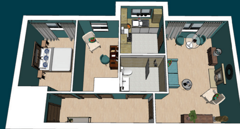
A typical property at Ashby Court

A company acts through two bodies of people – its shareholders and its Board of Directors. A Board of Directors is elected by the Shareholders of the Owners' Company. The number of Directors shall not be less than 3 but no more than 5. The Court's Board of Directors are in charge of the management of the company's business; supported by the Retirement Security team, they make the strategic and operational decisions of the company and are responsible for ensuring that the company meets its statutory obligations.