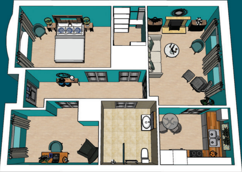
A typical property at Marlborough Court

A company acts through two bodies of people – its shareholders and its Board of Directors. A Board of Directors is elected by the Shareholders of the Owners’ Company. The number of Directors shall not be less than 3 but no more than 5. The Court’s Board of Directors are in charge of the management of the company’s business; supported by the Retirement Security team, they make the strategic and operational decisions of the company and are responsible for ensuring that the company meets its statutory obligations.