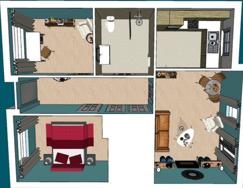
A typical property at Blake Court

A company acts through two bodies of people – its shareholders and its Board of Directors. A Board of Directors is elected by the Shareholders of the Owners’ Company. The number of Directors shall not be less than 3 but no more than 5. The Court’s Board of Directors are in charge of the management of the company’s business; supported by the Retirement Security team, they make the strategic and operational decisions of the company and are responsible for ensuring that the company meets its statutory obligations.