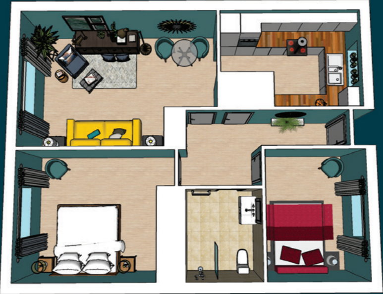
A typical property at Oaktree Court

A company acts through two bodies of people – its shareholders and its Board of Directors. A Board of Directors is elected by the Shareholders of the Owners’ Company. The number of Directors shall not be less than 3 but no more than 5. The Court’s Board of Directors are in charge of the management of the company’s business; supported by the Retirement Security team, they make the strategic and operational decisions of the company and are responsible for ensuring that the company meets its statutory obligations.