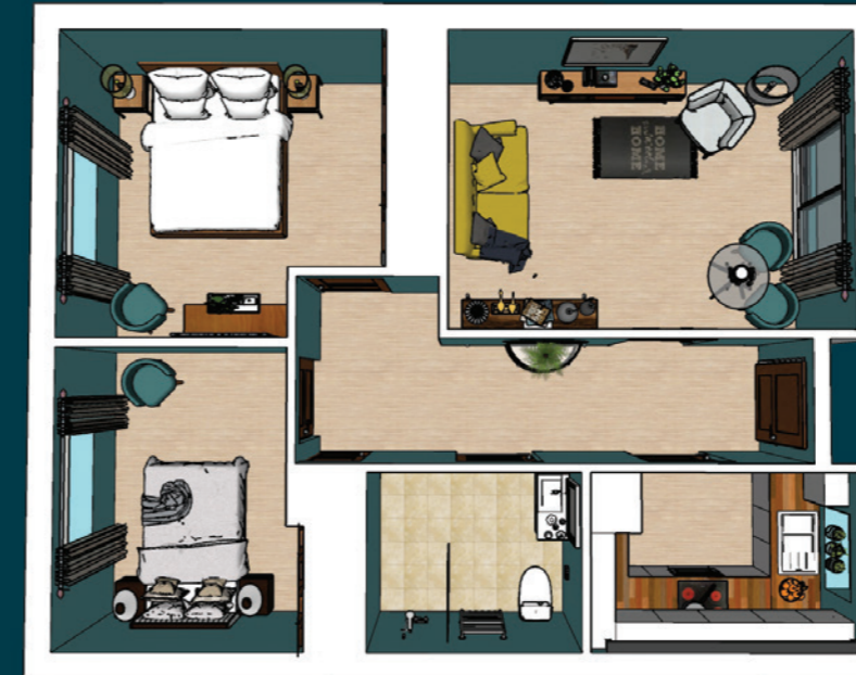
A typical property at Emmbrook Court

A company acts through two bodies of people – its shareholders and its Board of Directors. A Board of Directors is elected by the Shareholders of the Owners' Company. The number of Directors shall not be less than 3 but no more than 5. The Court's Board of Directors are in charge of the management of the company's business; supported by the Retirement Security team, they make the strategic and operational decisions of the company and are responsible for ensuring that the company meets its statutory obligations.