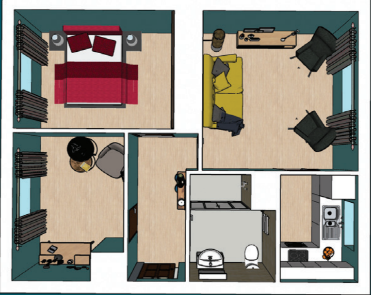
A typical property at Plymouth Court

A company acts through two bodies of people – its shareholders and its Board of Directors. A Board of Directors is elected by the Shareholders of the Owners’ Company. The number of Directors shall not be less than 3 but no more than 5. The Court’s Board of Directors are in charge of the management of the company’s business; supported by the Retirement Security team, they make the strategic and operational decisions of the company and are responsible for ensuring that the company meets its statutory obligations.