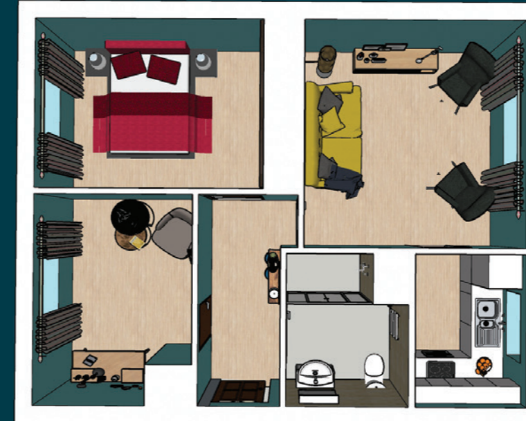
A typical property at Plymouth Court

A company acts through two bodies of people – its shareholders and its Board of Directors. A Board of Directors is elected by the Shareholders of the Owners' Company. The number of Directors shall not be less than 3 but no more than 5. The Court's Board of Directors are in charge of the management of the company's business; supported by the Retirement Security team, they make the strategic and operational decisions of the company and are responsible for ensuring that the company meets its statutory obligations.