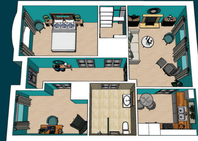
A typical property at Minster Court

A company acts through two bodies of people – its shareholders and its Board of Directors. A Board of Directors is elected by the Shareholders of the Owners' Company. The number of Directors shall not be less than 3 but no more than 5. The Court's Board of Directors are in charge of the management of the company's business; supported by the Retirement Security team, they make the strategic and operational decisions of the company and are responsible for ensuring that the company meets its statutory obligations.