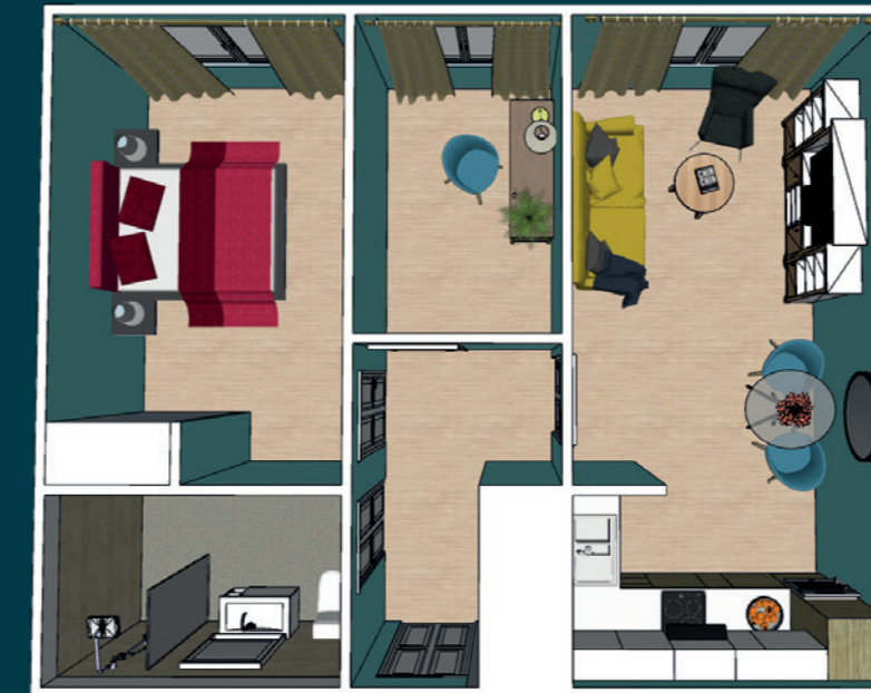
A typical property at Cathedral Green Court

A company acts through two bodies of people – its shareholders and its Board of Directors. A Board of Directors is elected by the Shareholders of the Owners' Company. The number of Directors shall not be less than 3 but no more than 5. The Court's Board of Directors are in charge of the management of the company's business; supported by the Retirement Security team, they make the strategic and operational decisions of the company and are responsible for ensuring that the company meets its statutory obligations.