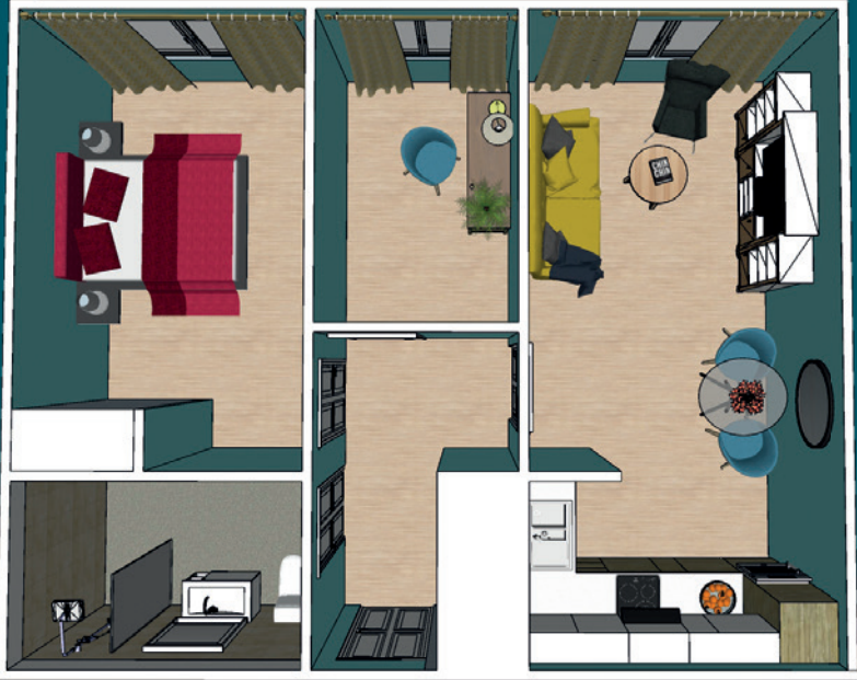
A typical property at Cathedral Green Court

A company acts through two bodies of people – its shareholders and its Board of Directors. A Board of Directors is elected by the Shareholders of the Owners’ Company. The number of Directors shall not be less than 3 but no more than 5. The Court’s Board of Directors are in charge of the management of the company’s business; supported by the Retirement Security team, they make the strategic and operational decisions of the company and are responsible for ensuring that the company meets its statutory obligations.