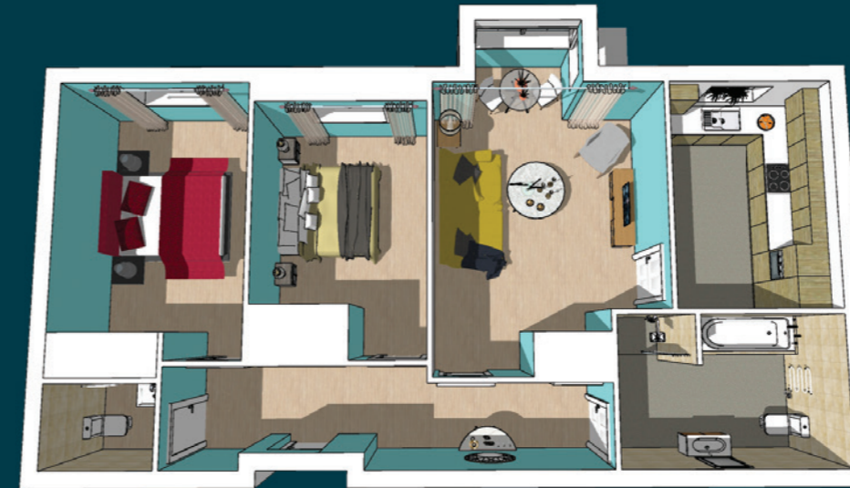
A typical property at Tannery Court

A company acts through two bodies of people – its shareholders and its Board of Directors. A Board of Directors is elected by the Shareholders of the Owners' Company. The number of Directors shall not be less than 3 but no more than 5. The Court's Board of Directors are in charge of the management of the company's business; supported by the Retirement Security team, they make the strategic and operational decisions of the company and are responsible for ensuring that the company meets its statutory obligations.