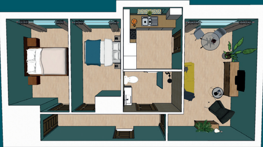
A typical property at St. George’s Court

A company acts through two bodies of people – its shareholders and its Board of Directors. A Board of Directors is elected by the Shareholders of the Owners’ Company. The number of Directors shall not be less than 3 but no more than 5. The Court’s Board of Directors are in charge of the management of the company’s business; supported by the Retirement Security team, they make the strategic and operational decisions of the company and are responsible for ensuring that the company meets its statutory obligations.