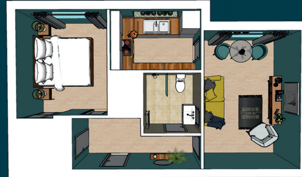
A typical property at Tiddington Court

A company acts through two bodies of people – its shareholders and its Board of Directors. A Board of Directors is elected by the Shareholders of the Owners' Company. The number of Directors shall not be less than 3 but no more than 5. The Court's Board of Directors are in charge of the management of the company's business; supported by the Retirement Security team, they make the strategic and operational decisions of the company and are responsible for ensuring that the company meets its statutory obligations.