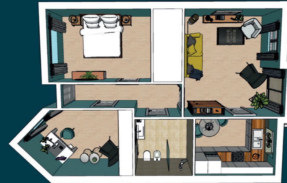
A typical property at Blundellsands Classic Court

A company acts through two bodies of people – its shareholders and its Board of Directors. A Board of Directors is elected by the Shareholders of the Owners' Company. The number of Directors shall not be less than 3 but no more than 5. The Court's Board of Directors are in charge of the management of the company's business; supported by the Retirement Security team, they make the strategic and operational decisions of the company and are responsible for ensuring that the company meets its statutory obligations.