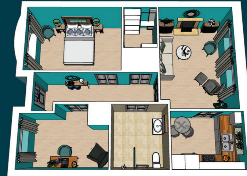
A typical property at Pinner Court

A company acts through two bodies of people – its shareholders and its Board of Directors. A Board of Directors is elected by the Shareholders of the Owners' Company. The number of Directors shall not be less than 3 but no more than 5. The Court's Board of Directors are in charge of the management of the company's business; supported by the Retirement Security team, they make the strategic and operational decisions of the company and are responsible for ensuring that the company meets its statutory obligations.