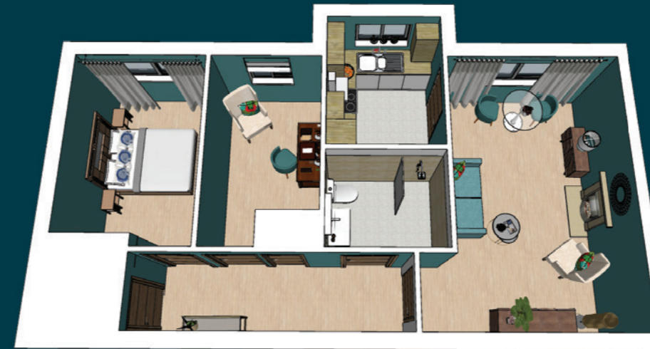
A typical property at Ashby Court

A company acts through two bodies of people – its shareholders and its Board of Directors. A Board of Directors is elected by the Shareholders of the Owners' Company. The number of Directors shall not be less than 3 but no more than 5. The Court's Board of Directors are in charge of the management of the company's business; supported by the Retirement Security team, they make the strategic and operational decisions of the company and are responsible for ensuring that the company meets its statutory obligations.