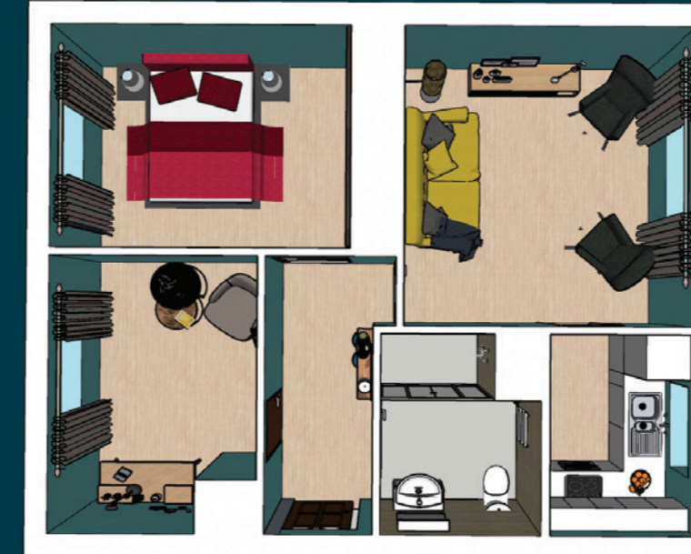
A typical property at Plymouth Court

A company acts through two bodies of people – its shareholders and its Board of Directors. A Board of Directors is elected by the Shareholders of the Owners' Company. The number of Directors shall not be less than 3 but no more than 5. The Court's Board of Directors are in charge of the management of the company's business; supported by the Retirement Security team, they make the strategic and operational decisions of the company and are responsible for ensuring that the company meets its statutory obligations.