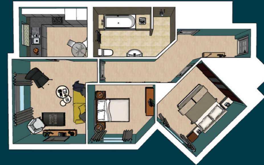
A typical property at Melton Court

A company acts through two bodies of people – its shareholders and its Board of Directors. A Board of Directors is elected by the Shareholders of the Owners' Company. The number of Directors shall not be less than 3 but no more than 5. The Court's Board of Directors are in charge of the management of the company's business; supported by the Retirement Security team, they make the strategic and operational decisions of the company and are responsible for ensuring that the company meets its statutory obligations.