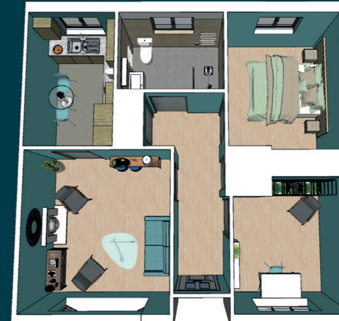
A typical property at Burcot Court

A company acts through two bodies of people – its shareholders and its Board of Directors. A Board of Directors is elected by the Shareholders of the Owners' Company. The number of Directors shall not be less than 3 but no more than 5. The Court's Board of Directors are in charge of the management of the company's business; supported by the Retirement Security team, they make the strategic and operational decisions of the company and are responsible for ensuring that the company meets its statutory obligations.