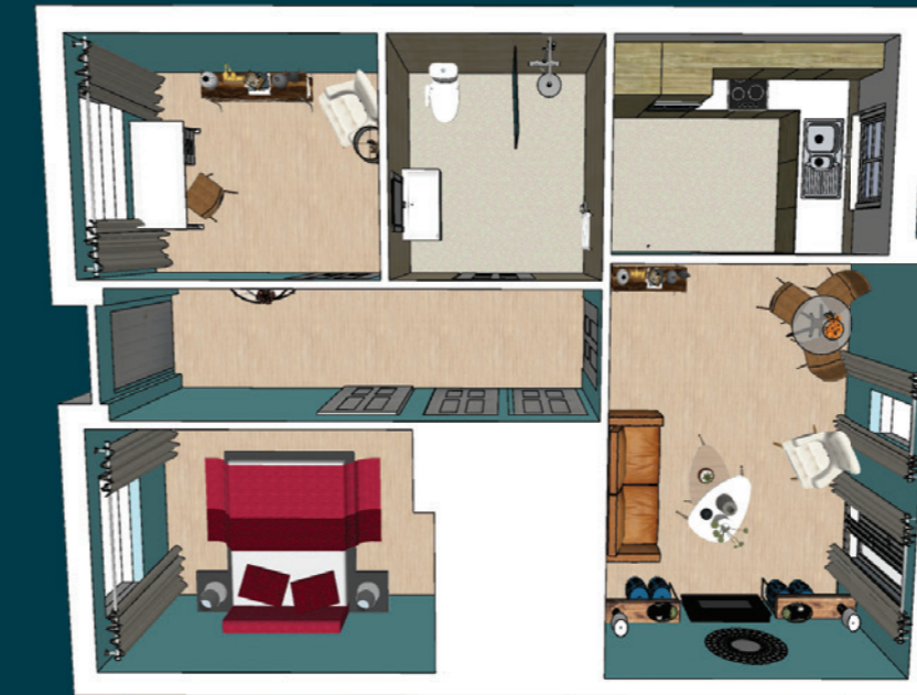
A typical property at Blake Court

A company acts through two bodies of people – its shareholders and its Board of Directors. A Board of Directors is elected by the Shareholders of the Owners' Company. The number of Directors shall not be less than 3 but no more than 5. The Court's Board of Directors are in charge of the management of the company's business; supported by the Retirement Security team, they make the strategic and operational decisions of the company and are responsible for ensuring that the company meets its statutory obligations.