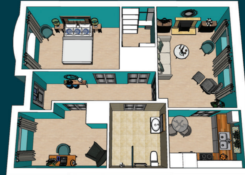
A typical property at Marlborough Court

A company acts through two bodies of people – its shareholders and its Board of Directors. A Board of Directors is elected by the Shareholders of the Owners' Company. The number of Directors shall not be less than 3 but no more than 5. The Court's Board of Directors are in charge of the management of the company's business; supported by the Retirement Security team, they make the strategic and operational decisions of the company and are responsible for ensuring that the company meets its statutory obligations.