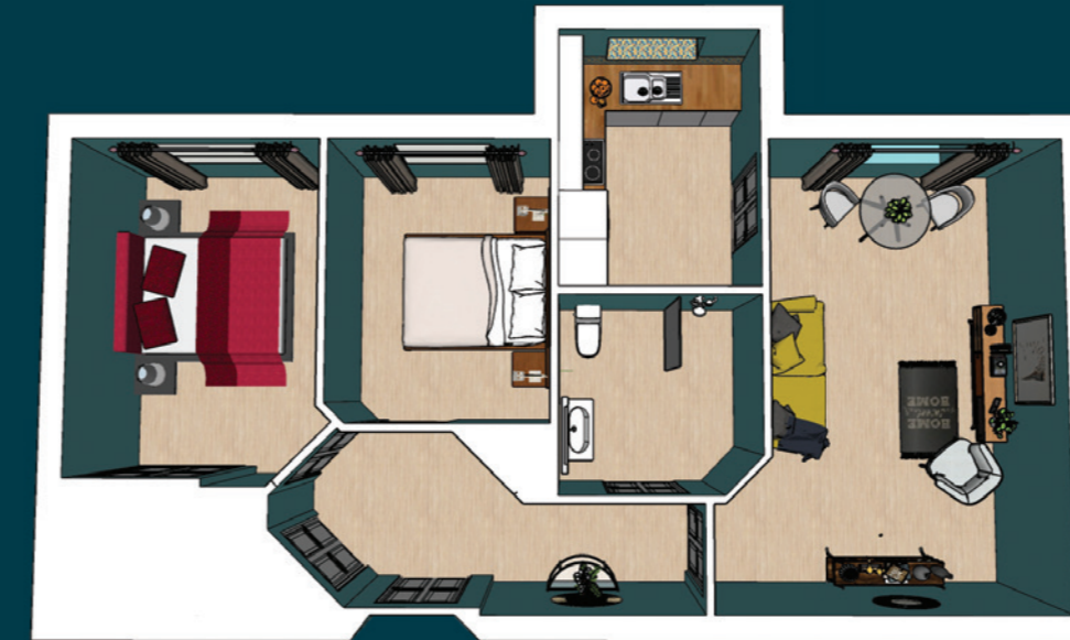
A typical property at Gorselands Court

A company acts through two bodies of people – its shareholders and its Board of Directors. A Board of Directors is elected by the Shareholders of the Owners' Company. The number of Directors shall not be less than 3 but no more than 5. The Court's Board of Directors are in charge of the management of the company's business; supported by the Retirement Security team, they make the strategic and operational decisions of the company and are responsible for ensuring that the company meets its statutory obligations.