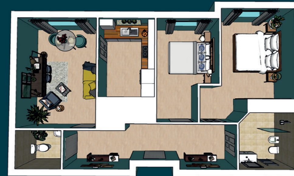
A typical property at Elizabeth Court

A company acts through two bodies of people – its shareholders and its Board of Directors. A Board of Directors is elected by the Shareholders of the Owners' Company. The number of Directors shall not be less than 3 but no more than 5. The Court's Board of Directors are in charge of the management of the company's business; supported by the Retirement Security team, they make the strategic and operational decisions of the company and are responsible for ensuring that the company meets its statutory obligations.