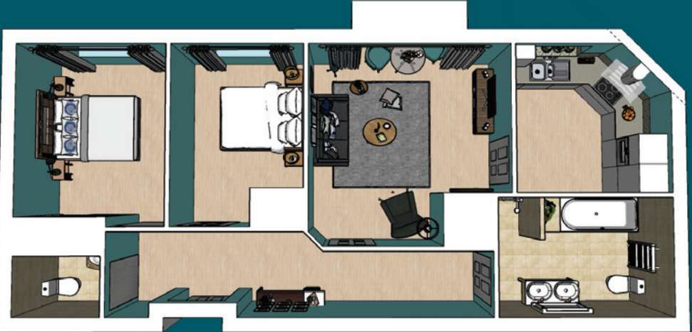
A typical property at Bushmead Court

A company acts through two bodies of people – its shareholders and its Board of Directors. A Board of Directors is elected by the Shareholders of the Owners’ Company. The number of Directors shall not be less than 3 but no more than 5. The Court’s Board of Directors are in charge of the management of the company’s business; supported by the Retirement Security team, they make the strategic and operational decisions of the company and are responsible for ensuring that the company meets its statutory obligations.