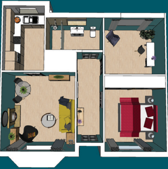
A typical property at Carrs Court

A company acts through two bodies of people – its shareholders and its Board of Directors. A Board of Directors is elected by the Shareholders of the Owners’ Company. The number of Directors shall not be less than 3 but no more than 5. The Court’s Board of Directors are in charge of the management of the company’s business; supported by the Retirement Security team, they make the strategic and operational decisions of the company and are responsible for ensuring that the company meets its statutory obligations.