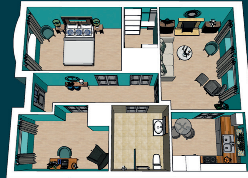
A typical property at Priory Court

A company acts through two bodies of people – its shareholders and its Board of Directors. A Board of Directors is elected by the Shareholders of the Owners' Company. The number of Directors shall not be less than 3 but no more than 5. The Court's Board of Directors are in charge of the management of the company's business; supported by the Retirement Security team, they make the strategic and operational decisions of the company and are responsible for ensuring that the company meets its statutory obligations.