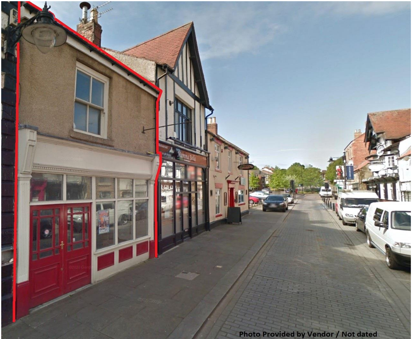
Not dated