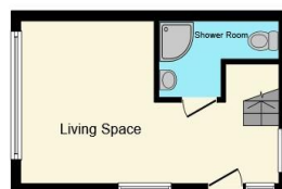
Annex Ground Floor