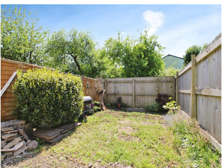
11' 5" Max x 9' 11" Max ( 3.48m Max x 3.02m Max )