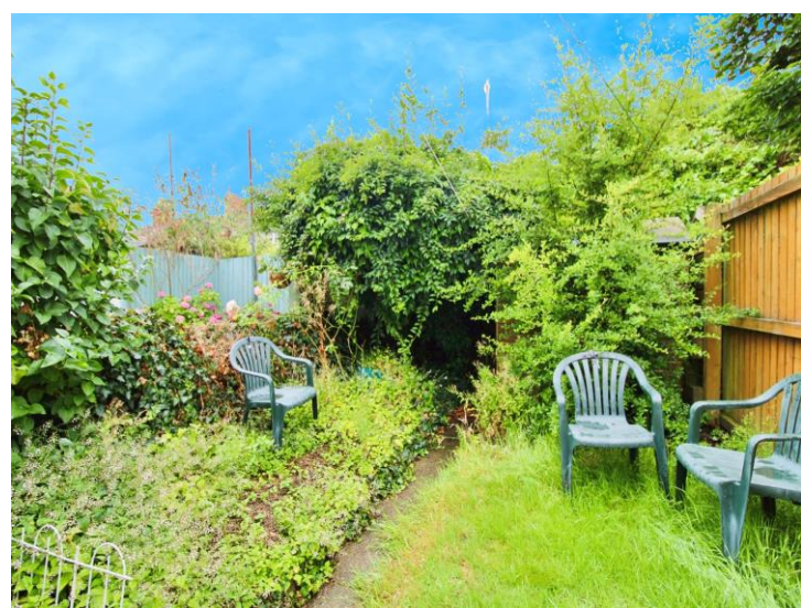
13' 4'' Max x 10' 2'' Max ( 4.06m Max x 3.10m Max )