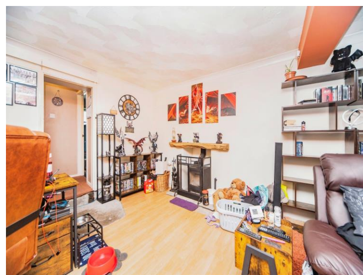
14' 7" max x 9' 8" max ( 4.45m max x 2.95m max )