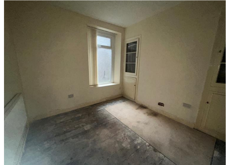
10' 9" Max x 10' 4" Max ( 3.28m Max x 3.15m Max )