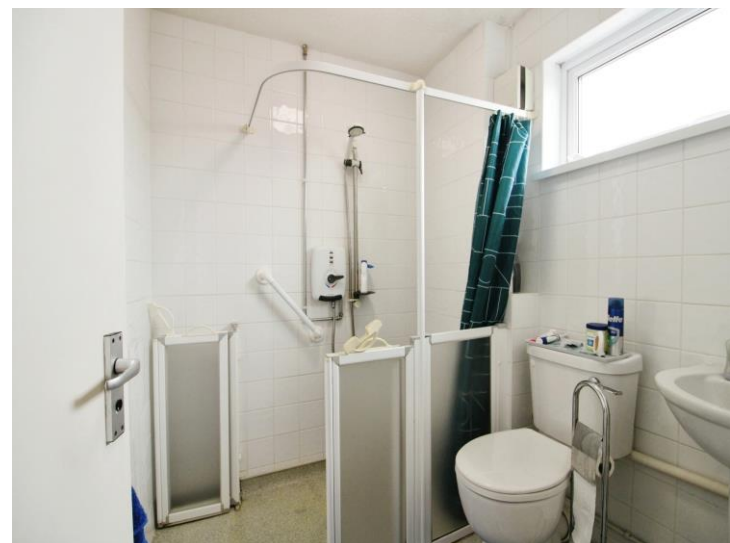
6' 9" x 6' 1" ( 2.06m x 1.85m )