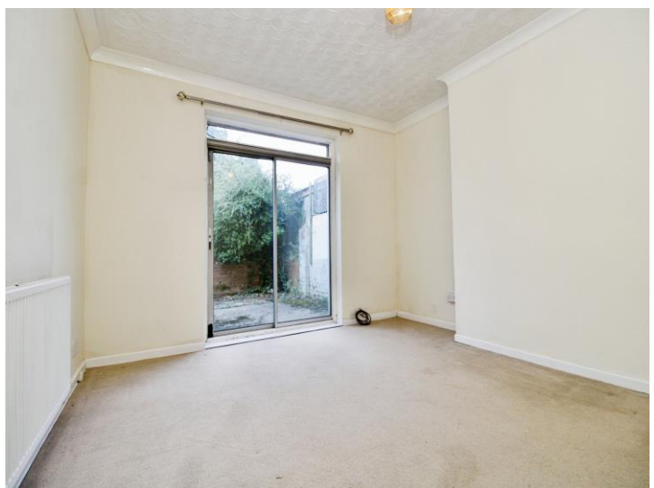
Double glazed window and door to side. Door to garage. Door to cloakroom.