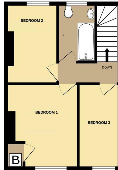
1ST FLOOR 378 sq.ft. (35.1 sq.m.) approx.